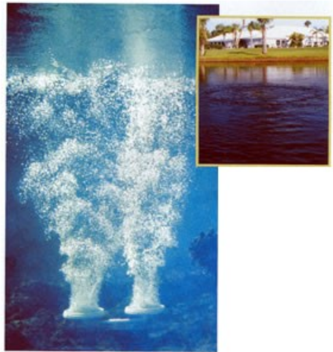
Fig. 1 EUTROPIC POND